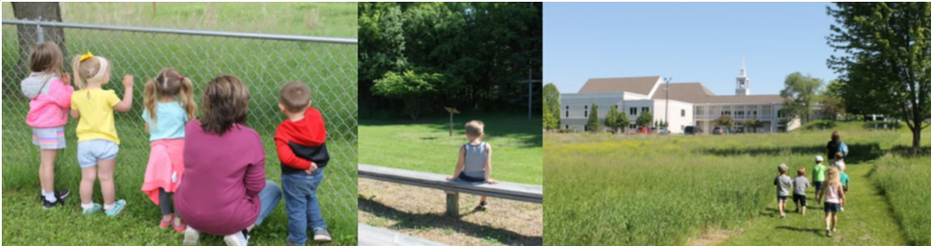
Pictures of our June class playing and walking on our beautiful property!

After closing our doors on March 14th due to the Coronavirus, we once again have kids in the classroom for our June Summer Fun class! New procedures were put in place for daily health screening for all staff and children, new cleaning procedures, no shoes while in the classroom, teaching kids social distancing, and spending the majority of class outside! What a blessing it is to hear the laughter of the kids and see their beautiful faces once again!